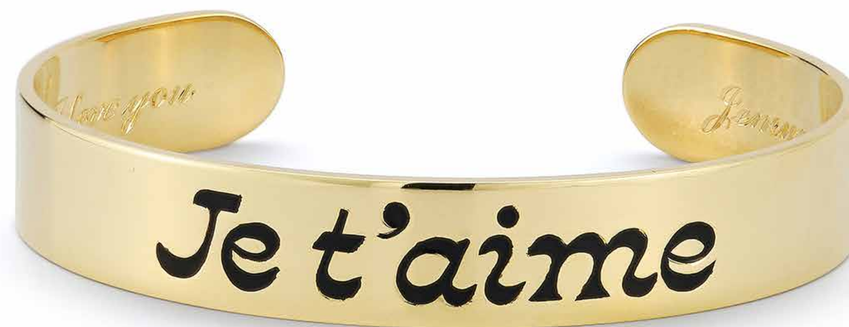
Love Notes Je t'aime Enamel Cuff by JEMMA WYNNE in 18K yellow gold. POA. https://jemmawynne.com