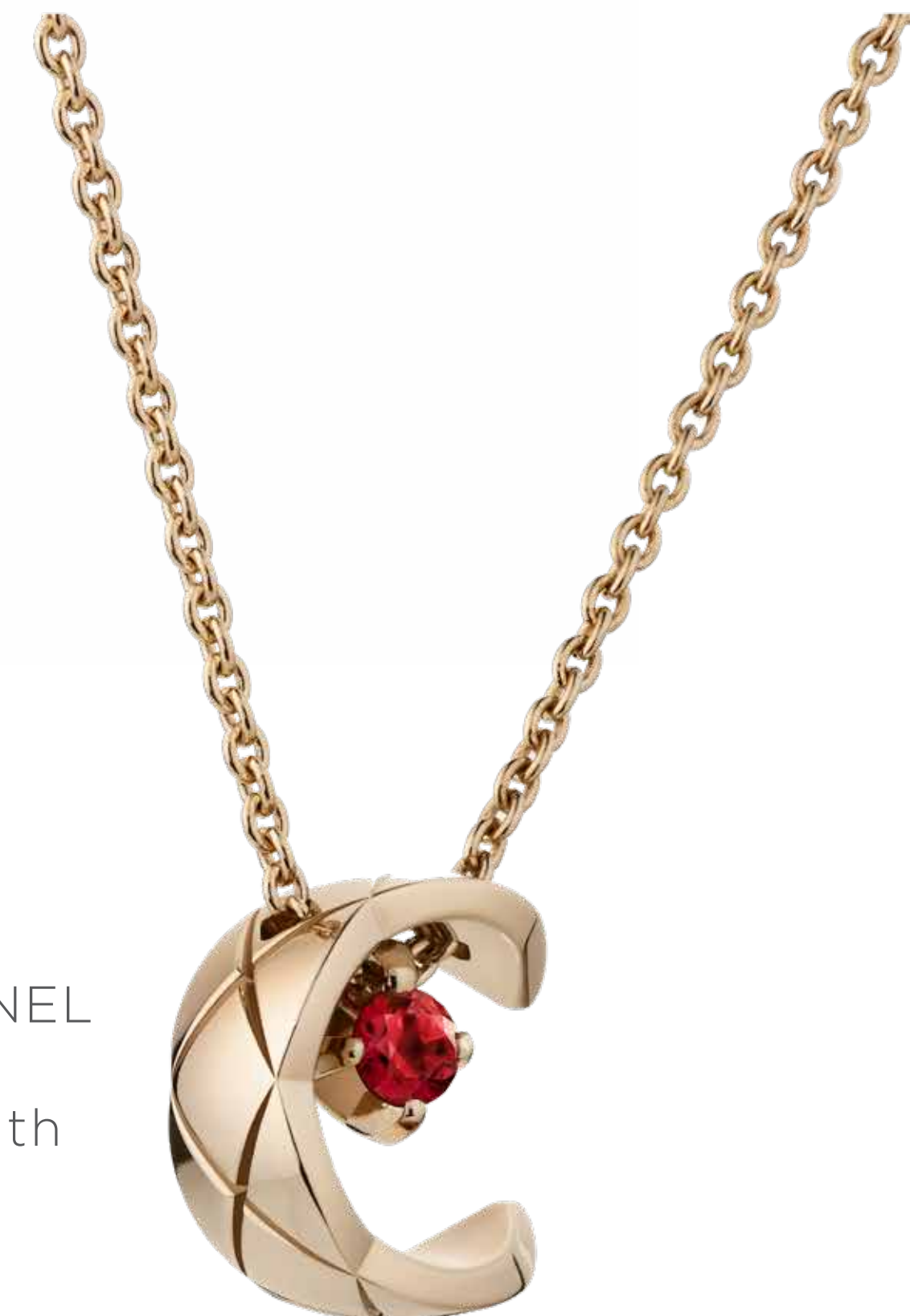
Coco Necklace by CHANEL in 18K beige gold with quilted motif and set with one ruby. POA.