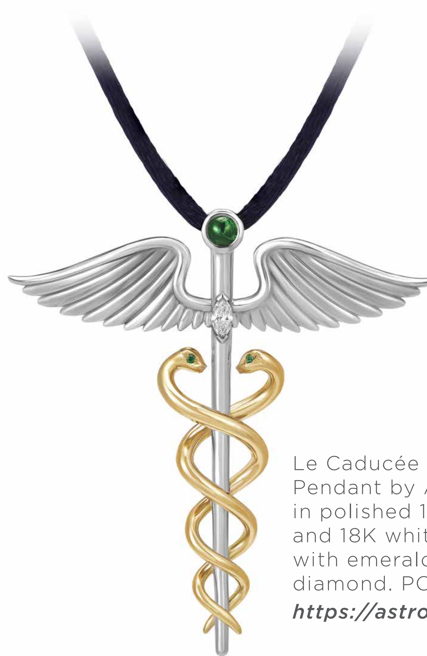
Le Caducée d'Hermès Pendant by ASTROM in polished 18K yellow and 18K white golds set with emeralds and one diamond. POA. https://astromparis.com

This is a transition from Chinese New Year of the Wood Snake to Valentine's Day though a selection of fine jewellery creations that celebrate both.