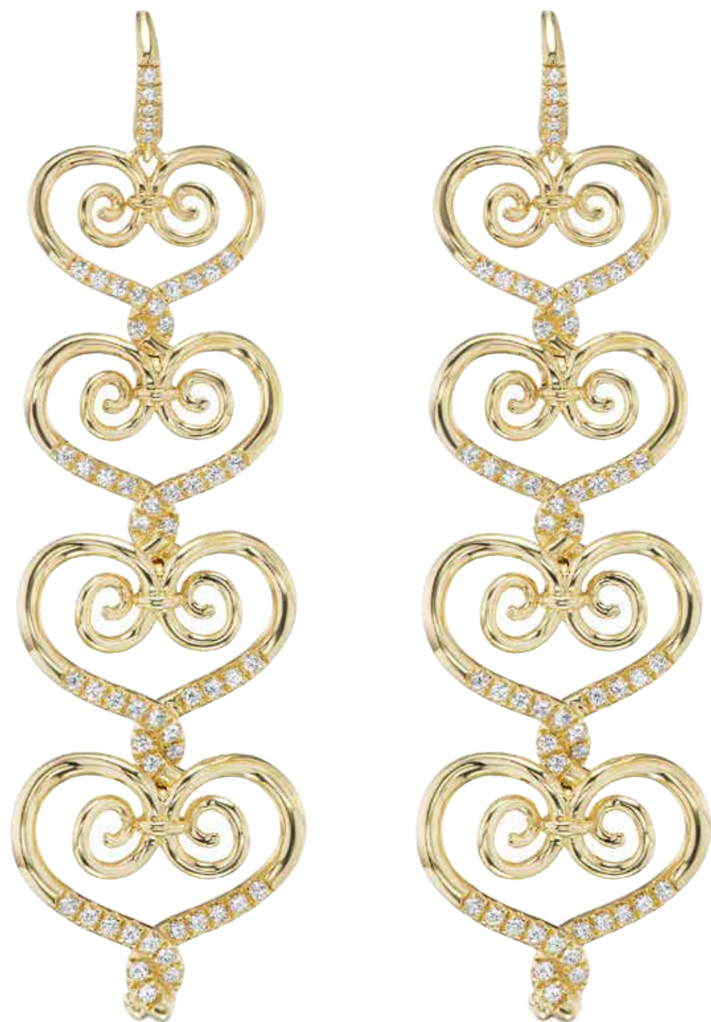
Venetian Heart Earrings by MARLO LAZ in 14K yellow gold set with white diamonds. POA.