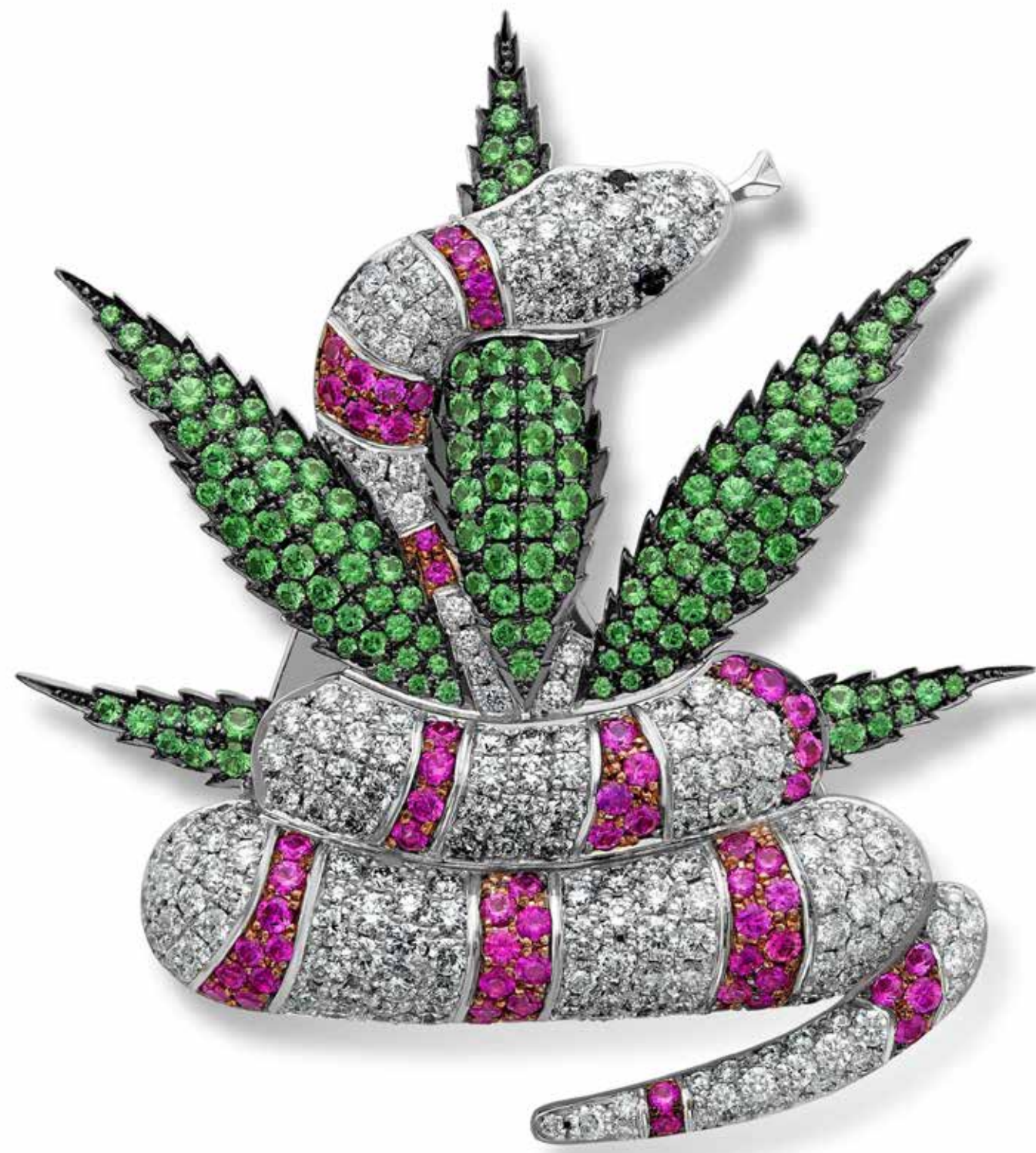
Snake and Leaf Brooch by THEO FENNELL in 18K white gold set with diamonds, rubies and tsavorites. POA. www.theofennell.com