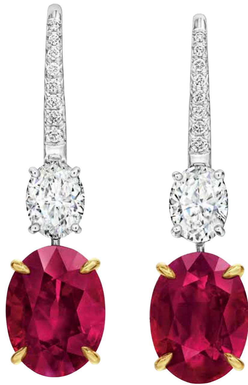
Important High Jewellery Earring by HARRY WINSTON in 18K yellow gold and platinum set with oval-shaped rubies and diamonds. POA. www.harrywinston.com