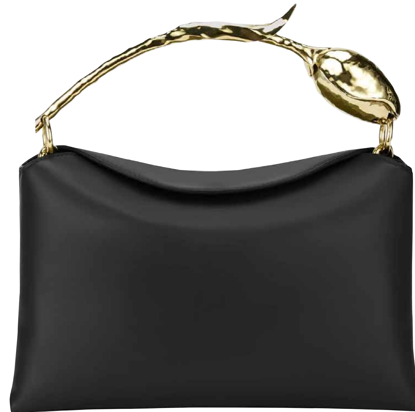
Midi Bloom Bag by ERDEM in smooth black leather with lost wax casted flower bud handle in gold tone. POA. www.erdem.com

A few perfect Valentine's Day gift ideas...from truly appealing to simply sublime!