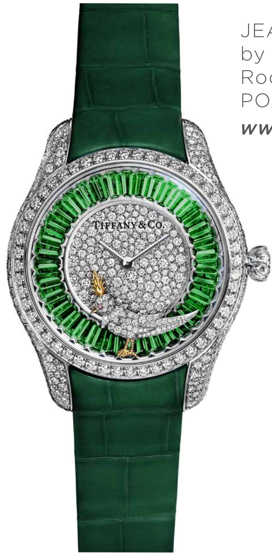
JEAN SCHLUMBERGER by TIFFANY Bird on a Rock Tsavorite Watch. POA.