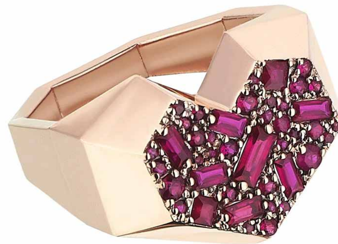
Cherish Ring by KISMET BY MILKA in 18K Roslow gold set with rubies. POA. https://kismetbymilka.com

This is a transition from Chinese New Year of the Wood Snake to Valentine's Day though a selection of fine jewellery creations that celebrate both.