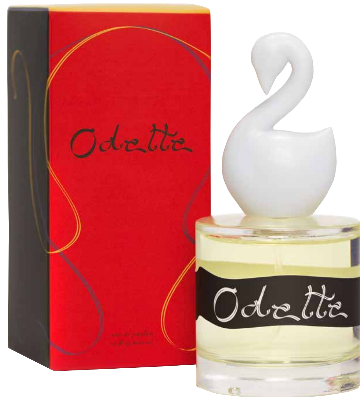
Odette, The White Swan Eau de Parfum by GUMAMINA. POA. www.gumamina.world