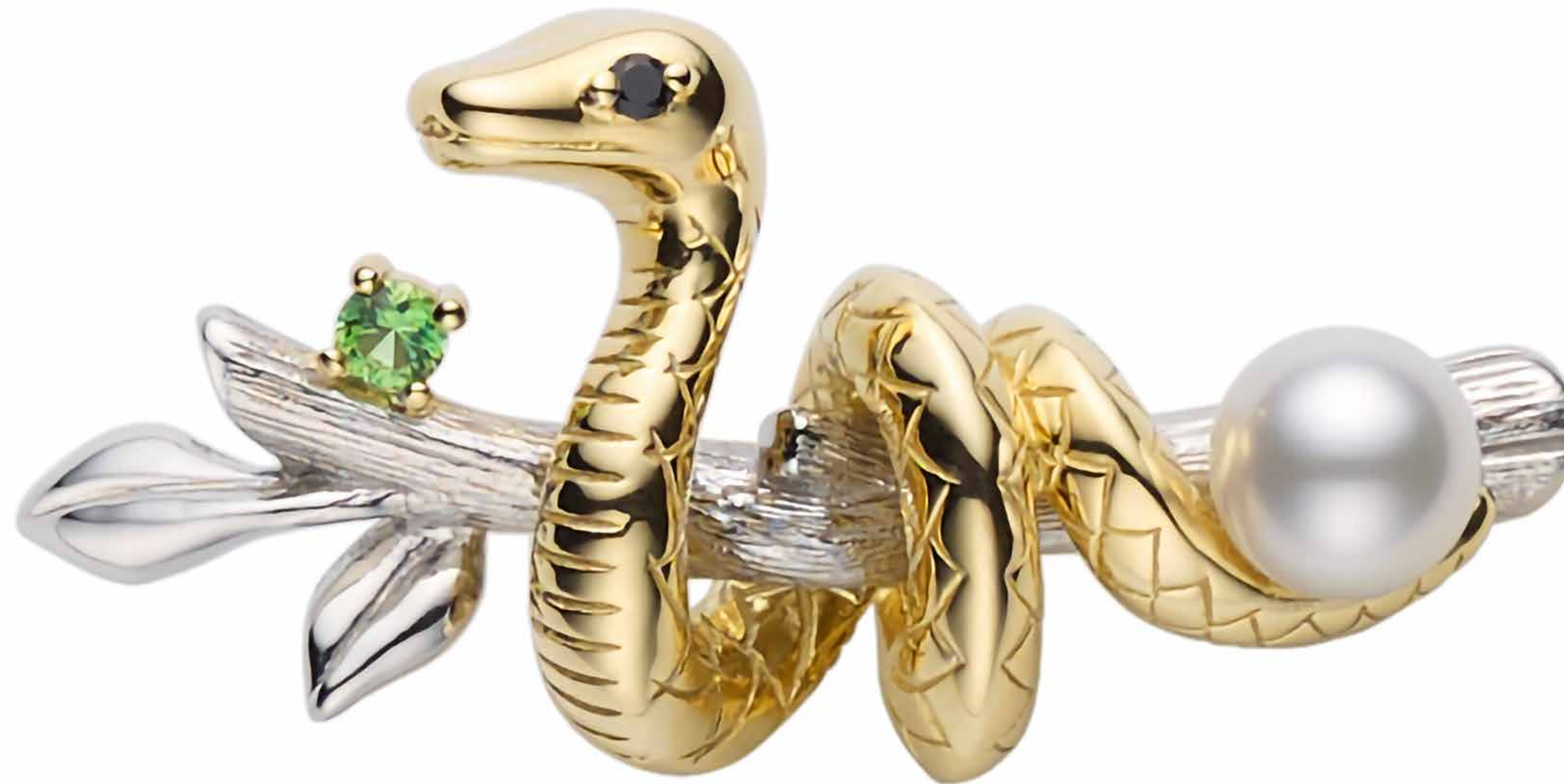
Wood Snake Brooch in 18K yellow gold and platinum set with one Akoya cultured pearl, one green garnet and one black spinel; limited-edition. POA.

Here is another seemingly friendly snake, this time courtesy of MIKIMOTO. The slender creature is coiled around a branch and rather than standing as if ready to strike, it seems to greet us with a ‘Hello you!’ Drawing inspiration from traditional Chinese beliefs that the Wood Snake blends charm and mystery, the brooch is set in 18 carat yellow gold for the snake, platinum for the branch and is decorated with an Akoya cultured pearl (held by the snake’s tail), a green garnet (a little bud heralding springtime), and a black spinel for the snake’s eye. The horizontal position is perfect suited to accessorise a lapel, a belt, a corsage and why not one’s hair. The brooch is available to buy instore from Mikimoto, 179 New Bond Street or Harrods, Fine Jewellery Room starting from end of January 2025.