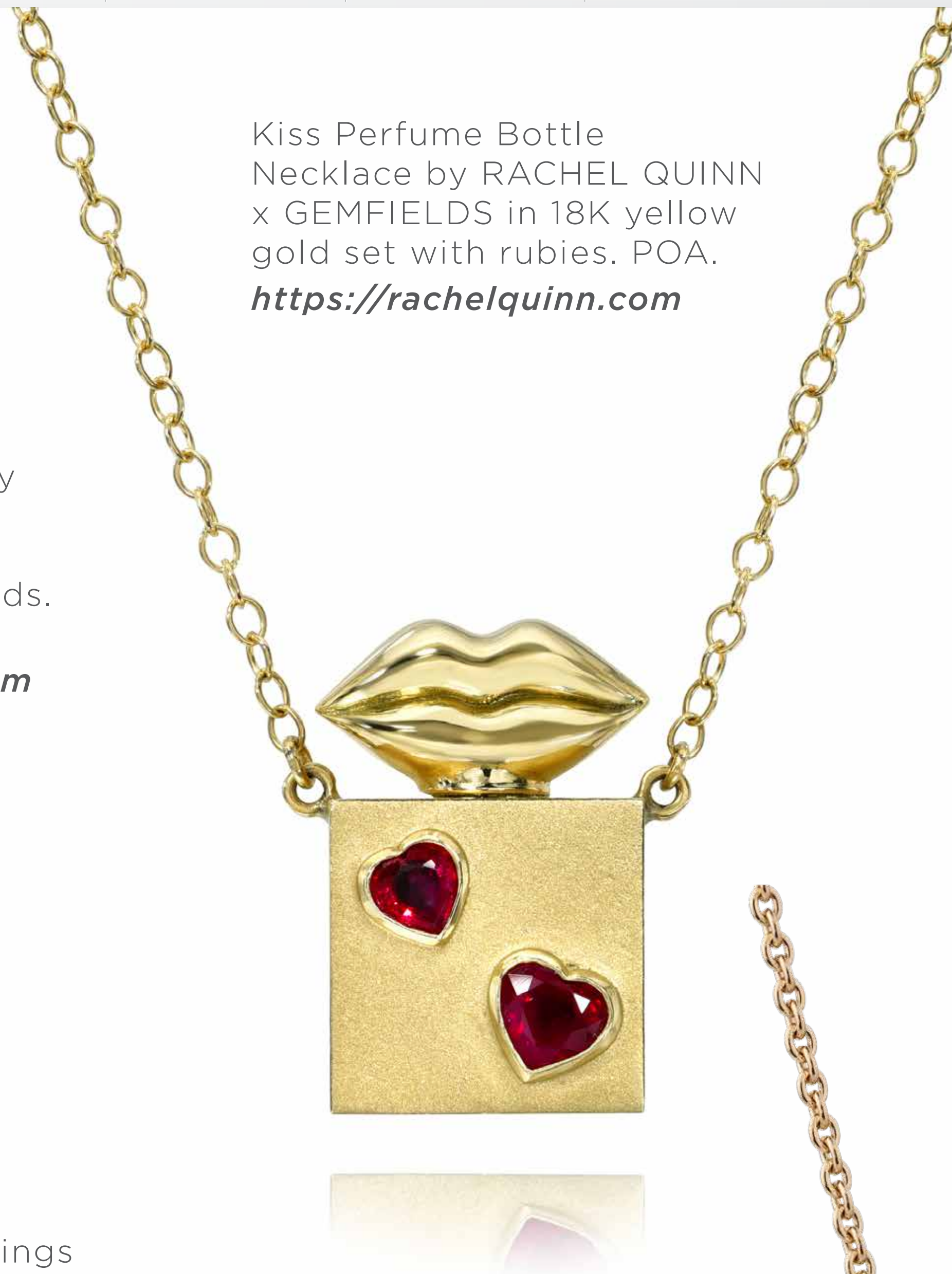
Kiss Perfume Bottle Necklace by RACHEL QUINN x GEMFIELDS in 18K yellow gold set with rubies. POA.