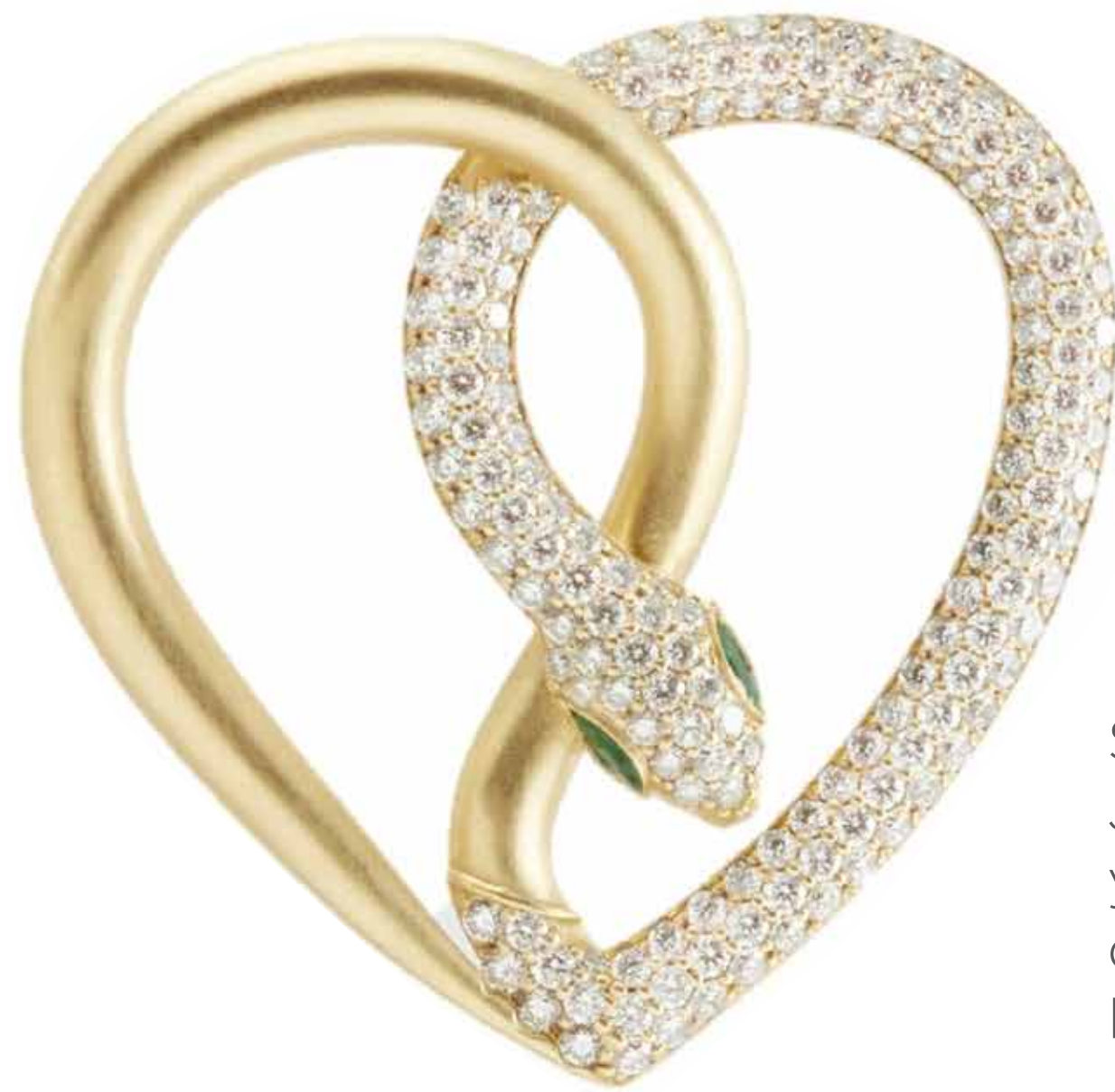
Snake Heart Charm by JENNA BLAKE in 18K yellow gold set with diamonds and emeralds. POA.