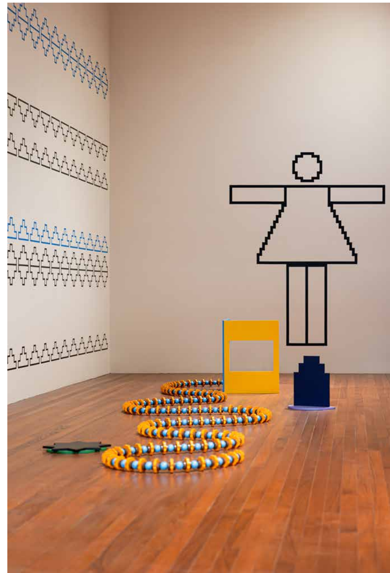
‘Snake - Too Long’ Artwork by Chinese artist, Hong Seung-Hye – part of the Serpenti Infinito Exhibition.

The Serpenti Infinito Exhibition comprises three chapters and includes 28 artworks by 19 Chinese and international artists, of which 11 were created exclusively for the occasion. The guests had also the opportunity to admire a magnificent selection from BVLGARI Heritage, watches and fine jewellery collections, including some unreleased High Jewellery one-of-a-kind creations. Woven like an endless braid, the Serpenti Infinito High Jewellery necklace, bracelet and brooch are set with onyx components, buff top rubies and pavé diamonds. In an even more abstract exercise, a whopping 140.53-carat rubellite is the beating heart of the Serpenti Rubellite Crown High Jewellery necklace – the first ever Serpenti chain sautoir made of onyx inserts, buff-top emeralds and diamonds. From the start, the reptile motif has also made its way into BVLGARI accessories (mostly in the form of a bejewelled clasp), and so here comes the new Serpenti Cuore 1968 bag, launched on the occasion of the Year of the Snake. As the name reveals, its distinctive shape recalls the two halves of a heart: one made up of the bag’s red body, the other of the arched snake body-shaped handle.